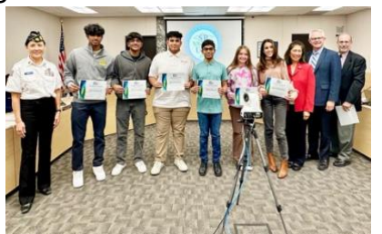
Boys and Girls State Delegates Recognized by School Board

The American Legion | Mt. Diablo Post 246 Meets Monthly | 400 Hartz Ave, Danville, CA 94526 Mailing: P.O. Box 133, Danville, CA 94526 | 925.272-8480 https://www.americanlegionpost246.org Email: CommanderPost246@gmail.com