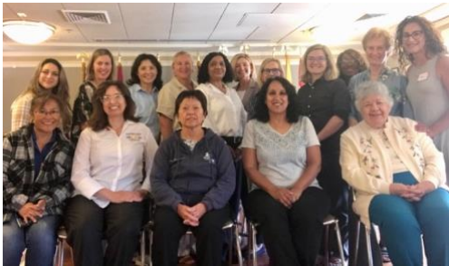
Women Veterans Tea Participants

Have you heard the adage, "Contentment is not complacency"? This statement seems apropos in a Legion year-end, State-of-the-Post type reflection. In the past