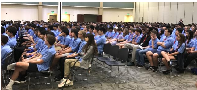
Delegates at opening session of the inaugural 2023 California Boys and Girls State

In the inaugural session of the California Boys and Girls State in June, about 900 high school juniors from across California convened at the California State University Sacramento campus to experience first-hand the