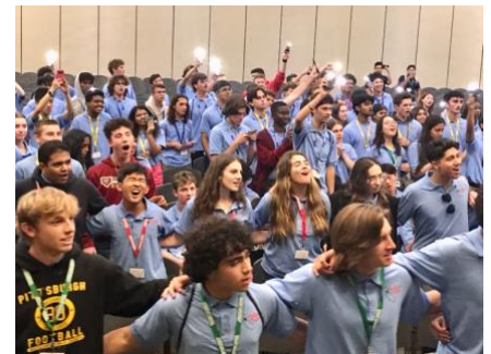
A spirited party rally at CBGS 2023