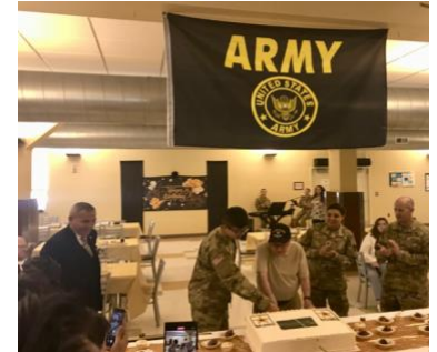
Happy 248th Birthday US Army!