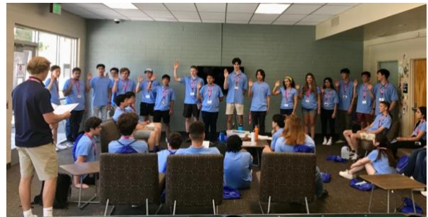
Swearing in Crocker City, Haley County, and other elected officials at California Boys and Girls State 2023